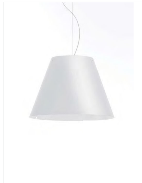
D13G si - D13G sflu